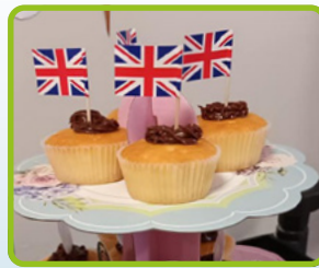
p2-3 Platinum Jubilee Celebrations 2022!